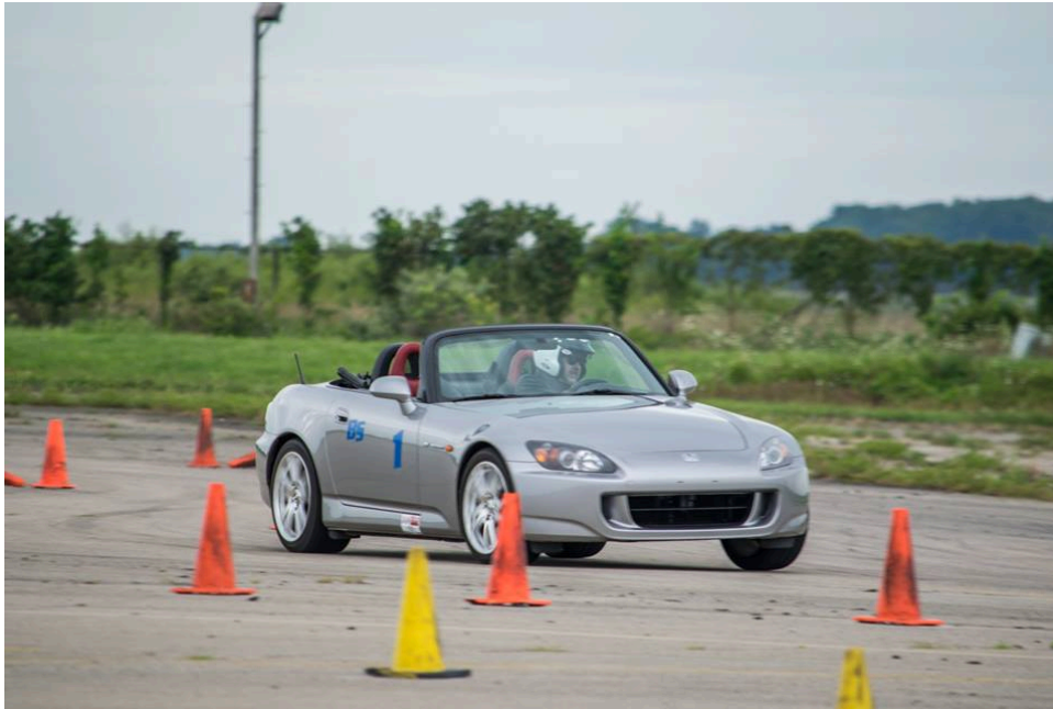
Current Tovey Cup leader on his way to a BS class win at Hoosier challenge